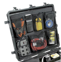
1699 Lid Organizer