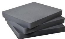
1692 Pick N Pluck™ Sections Only (set of 3)