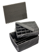
1695 Padded Divider Set