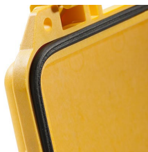
1693 Replacement O-ring